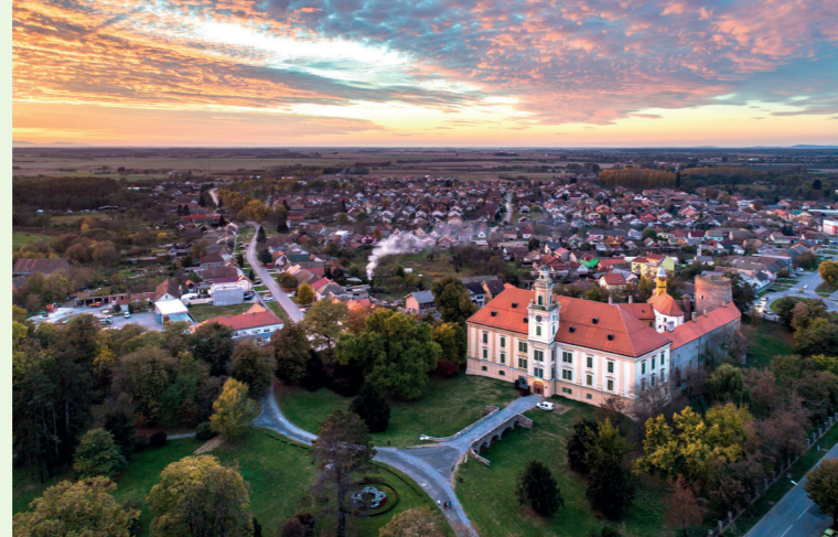
Castle Prandau Normann.