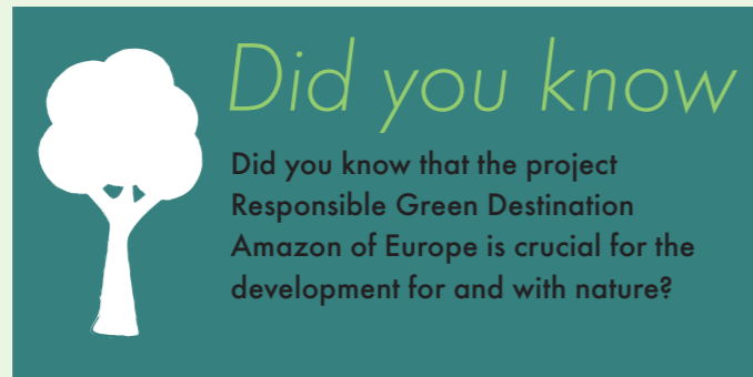
Green island.