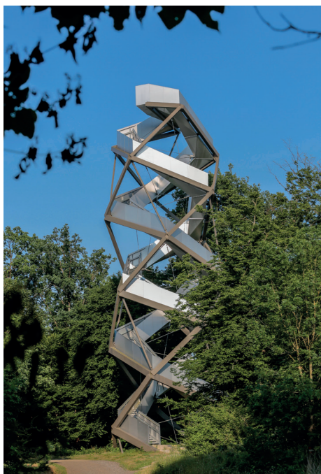
Bad Radkersburg Mur tower.

Did you know that the TBR MDD area provides a great opportunity for the development of sustainable tourism?