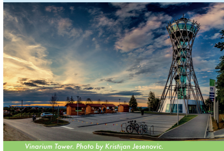
Vinarium Tower.

1. Stimulate environmentally friendly behaviour in tourism sector – development and testing of the Responsible Green Destination Tourism Impact Model (RGD TIM model), which will form the basis for establishing the transboundary destination Amazon of Europe. It will combine latest