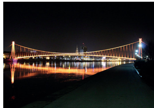
Pedestrian and cyclist bridge.

Project aim is to enhance sustainable economic growth and tourism development based on distinctive natural and cultural heritage, which will enhance the cooperation between the regions and enabling environment for high-quality tourism, responding to limited resources of ecosystems.