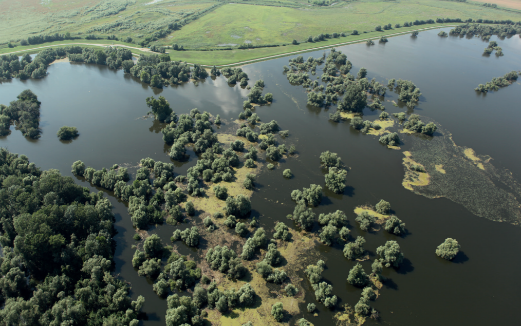
NP Kopački rit.