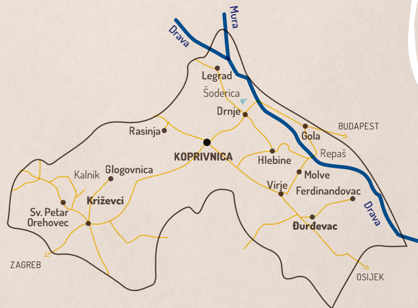
Map of Croatia and county are for illustrative purpose only.